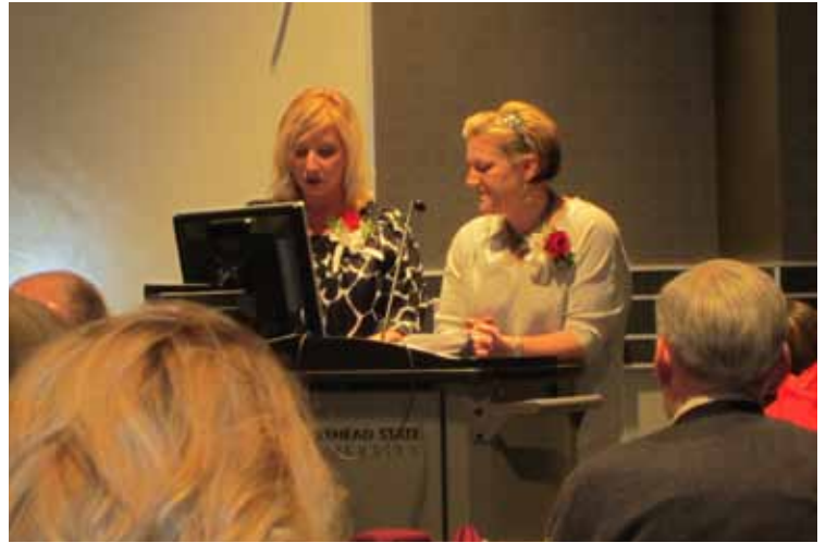
Two CRNA students take a moment to thank SCR staff for their dedication during their clinical training.