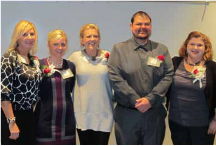
Five CRNA students recently completed the Baptist Health/Murray State University program.