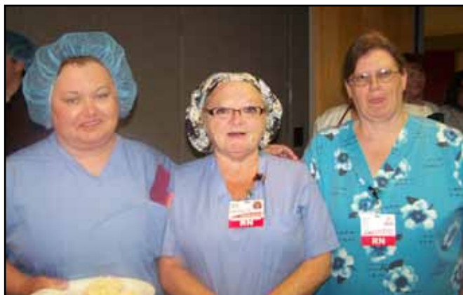
Nurses from Surgery and Hospice enjoy the Nurses' Week Breakfast