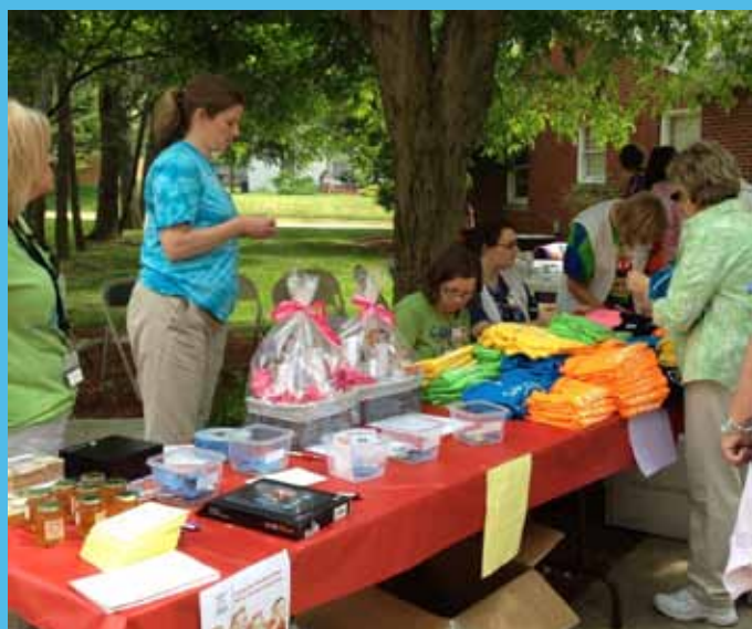
SCR Hospice and Palliative Care raised money for this Camp Smile 2013 at the Hospital Week BBQ.