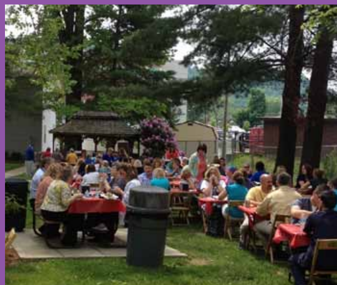
SCR staff enjoyed beautiful weather and a great lunch at the Hospital Week BBQ.