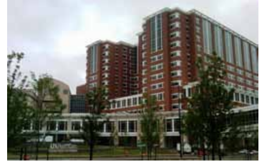
University of Kentucky

Highlands Regional Medical Center, Our Lady of Bellefonte Hospital, St. Claire Regional Medical Center, St. Mary's Medical Center and UK HealthCare have a combined 1,783 patient care beds, more than 14,400 employees and 1,780 physicians.