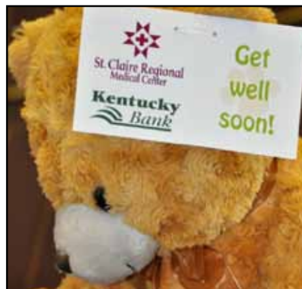
A "Get well soon!" card will be attached to each teddy bear.