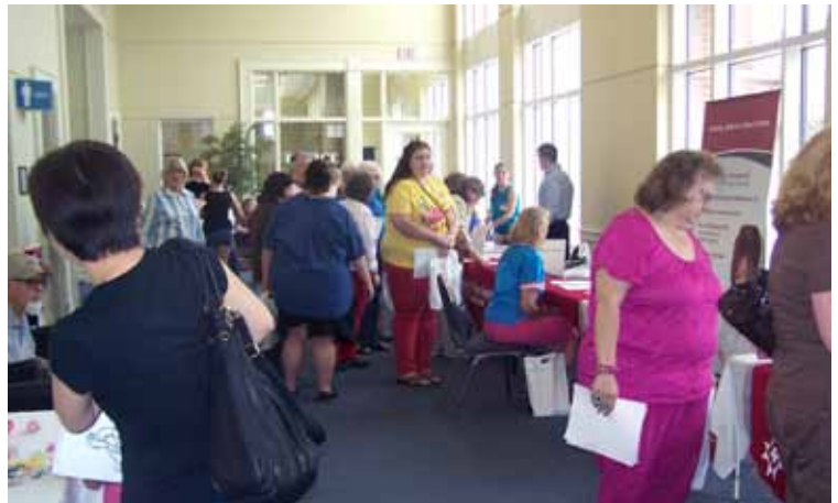
Over 100 women participated in the One Night, About You event.