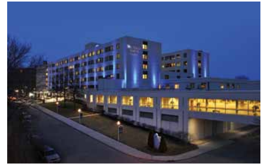
St. Mary's Medical Center

The mission of the Eastern Kentucky Healthcare Coalition