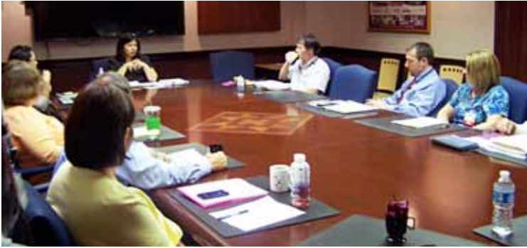
SCR Primary Care Providers and Leadership attending one of the three assessments.

On July 16, representatives from Bon Secours and Aetna visited SCR and conducted assessments of care management and patient engagement capabilities to prepare for the launch of the GoodHelp ACO programs which were designed to accelerate our population health efforts. In August a gap analysis report will be published to guide our work plan to develop our own internal care management capabilities and engage our partners, GoodHelp ACO and Aetna, in this new exciting journey.