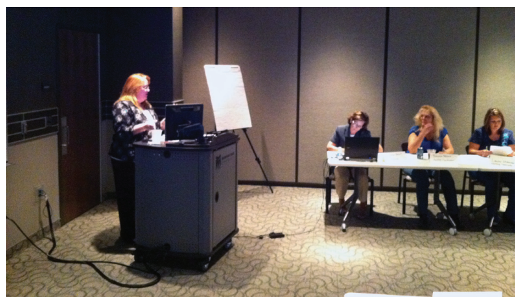
SCR Emergency Response Staff, local emergency services and the Emergency Management Agency participating in a code silver active shooter tabletop exercise on Wednesday, September 11 in the Center for Health Education and Research.