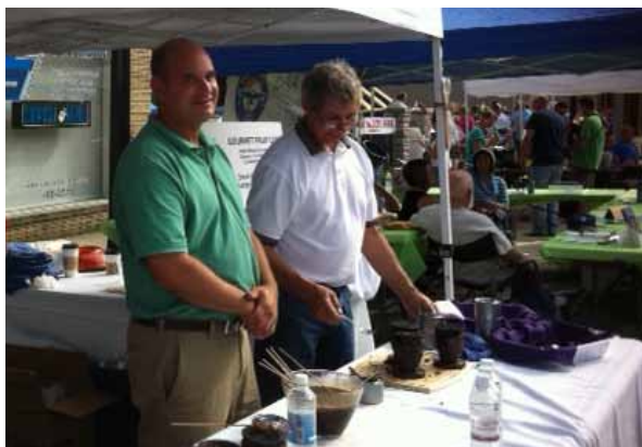
SCR Staff prepare seared tuna kabobs and gourmet fruit cups

The smell of fall surrounded guests as they walked from booth to booth sampling sweet treats and various art works from the region at the 2nd Annual Autumn Arts and Eats Festival in Morehead. St. Claire Regional (SCR) participated with a booth set up on the heart of Main Street.