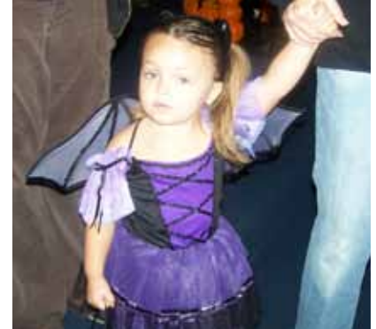
This little bat girl wasn't scared by any goblins