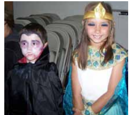
Count Dracula and the Queen of Egypt enjoyed the Halloween bash