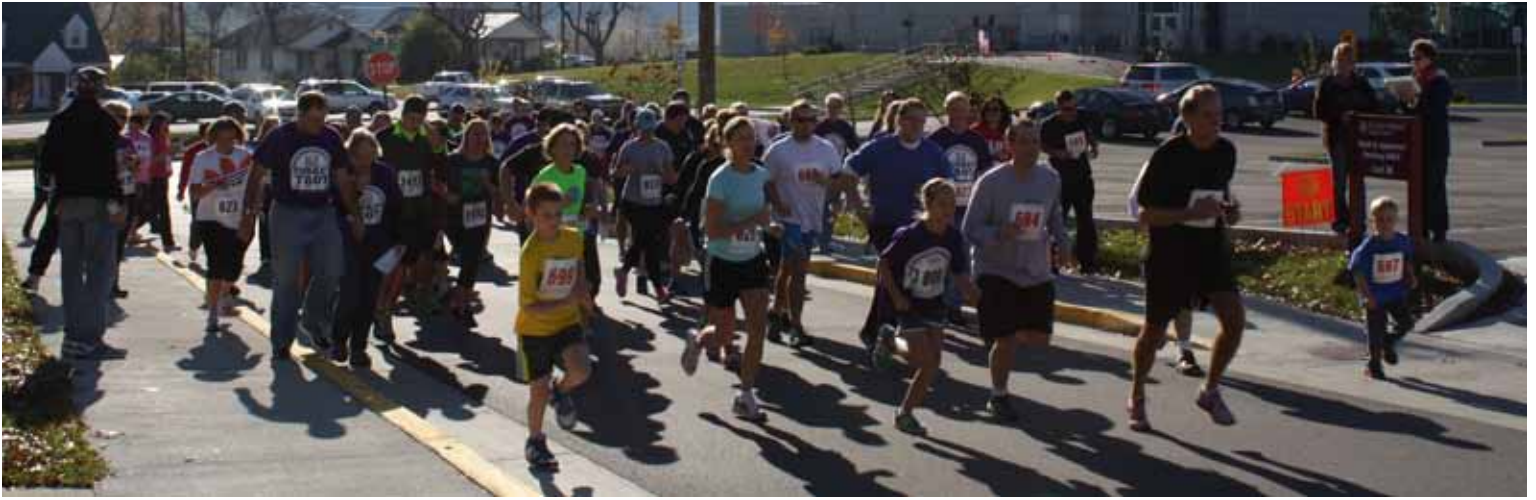
Turkey Trot for a Cure runners and walkers take off at the starting line