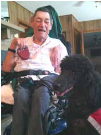
Halle with one of the many nursing home residents she visited.