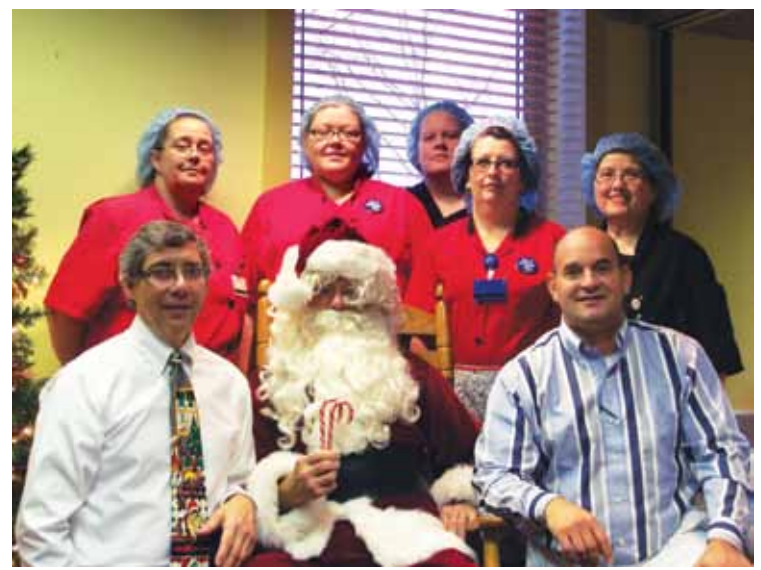
Food Services taking a few minutes to enjoy time with Santa after preparing wonderful holiday treats for SCR staff.