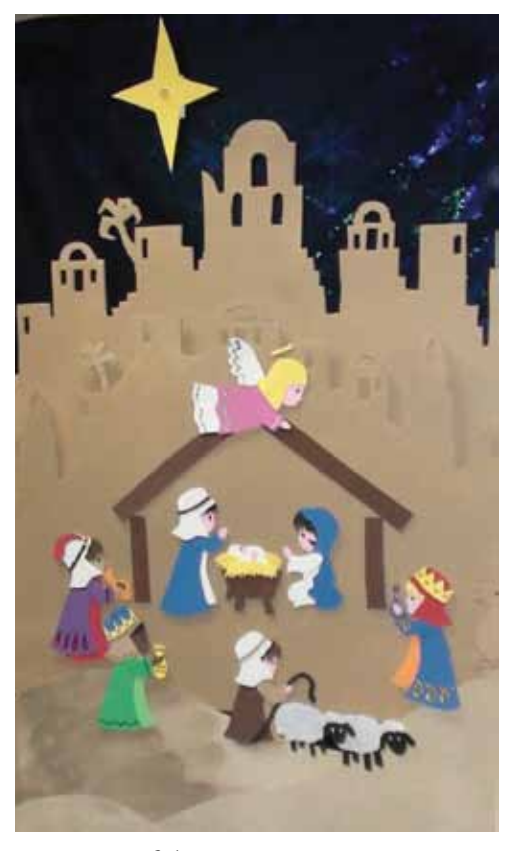
Most Beautiful 1st Sandy Hook Family Medicine 2nd Bio-Med 3rd Same Day Surgery 3rd – 3Central