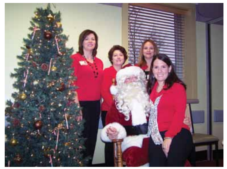
Human Resources being Santa's helpers by giving out the staff Christmas gifts.