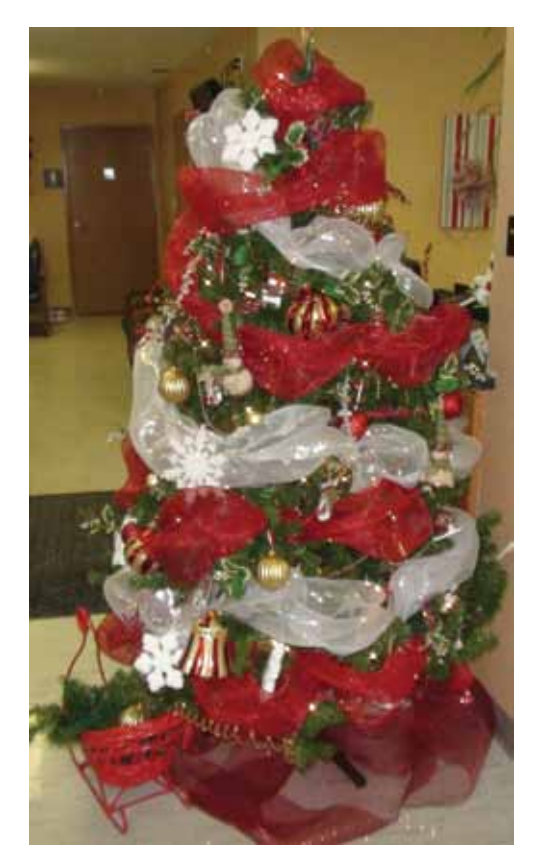
Most Creative 1st MMS – Insurance Dept. 2nd 5th Floor 3rd MMS – IM Dept.3rd Centralized Scheduling