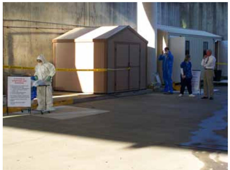
St. Claire Regional disaster drill's help prepare SCR staff for future possible disaster crisis. Pictured above photographs from past drills.