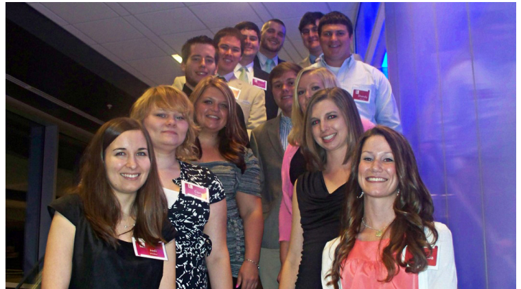
Class of 2012 Letters From Home Students.

The “Letters From Home” program is a mechanism for staying in touch with students throughout their medical education through dinners at the colleges, quarterly email and mailing updates. This provides encouragement to them to return back home for rotations as well as return to practice when they complete their education.