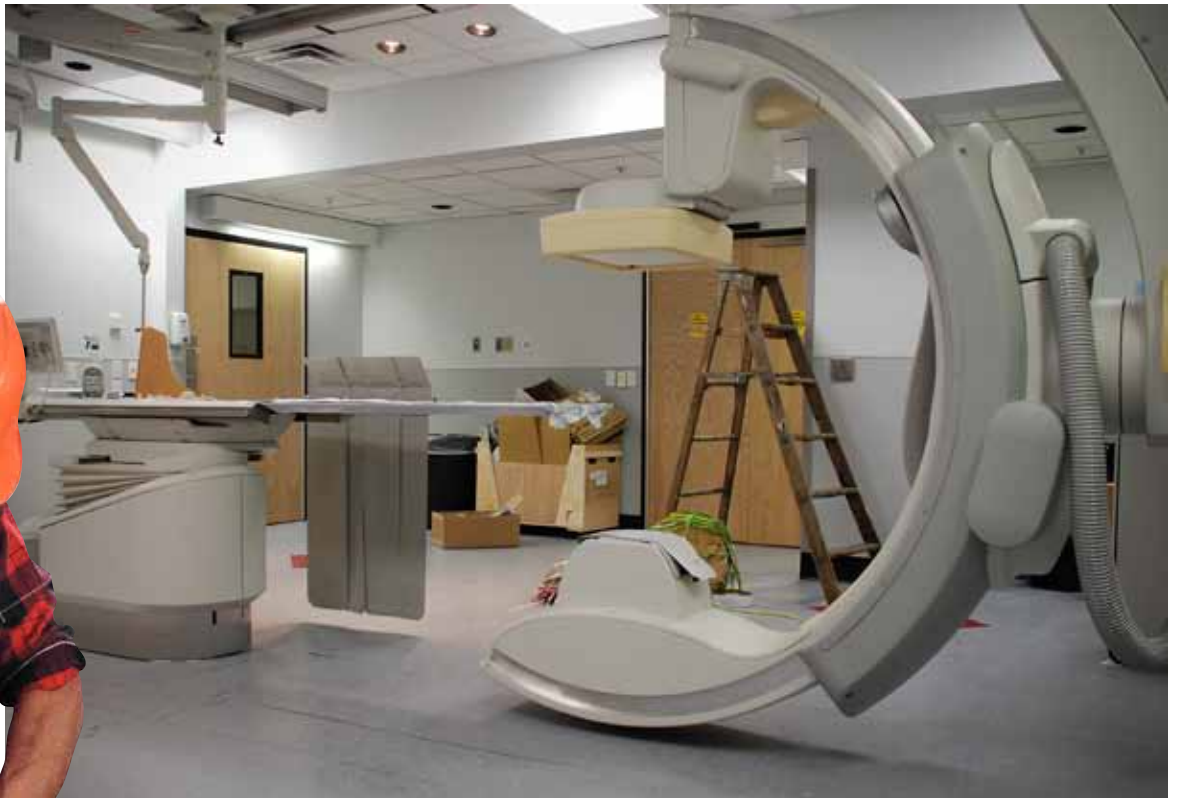
Equipment for the new cardiac catheterization lab has been installed and is currently undergoing calibration testing.

SCR continues construction on the Women's Imaging Center and the second cardiac catheterization lab in preparation of their June openings.