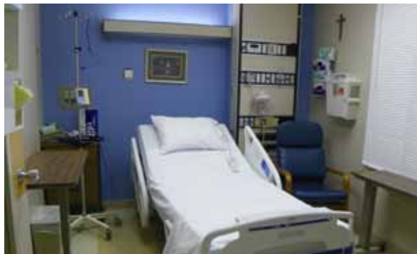
The new wall color helps provide patients a calm environment.

return back home for clinical rotations as well as return to practice when they complete their education.