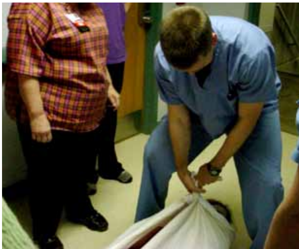
Nursing staff on 5th floor practice emergency evacuation techniques during the disaster drill by using one another for stand-in patients.

On May 18, St. Claire Regional (SCR) conducted a Code Yellow disaster drill to test response and preparedness in the event of a natural disaster or emergency. The drill was conducted in conjunction with a national level, week-long disaster exercise organized by the Central U.S. Earthquake Consortium. SCR was called to actively participate during day 3 of the drill. SCR was given a 7.7 magnitude earthquake scenario, which had allegedly occurred along the New Madrid Fault. SCR received communication from Kentucky Emergency Management officials detailing the situation and notifying SCR that 150 – 200 patients would be transferred to the region. All medical centers were requested to assess their patient capacity and their capability to establish alternate care sites for additional patients.