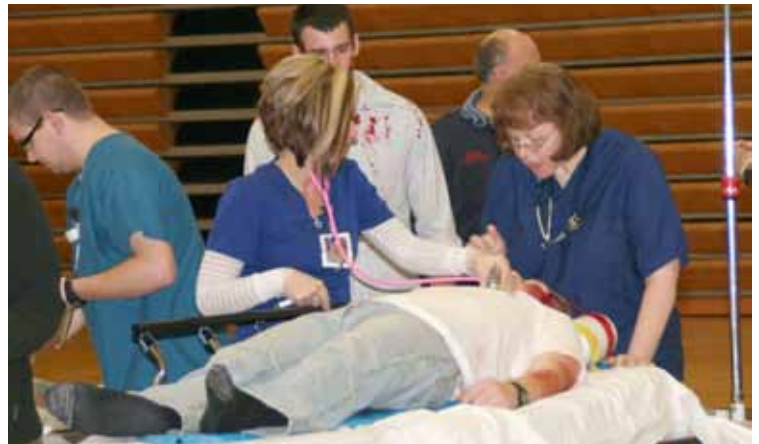
SCR emergency department staff set up a mock emergency department and treated 'crash victims' in RCSHS gymnasium