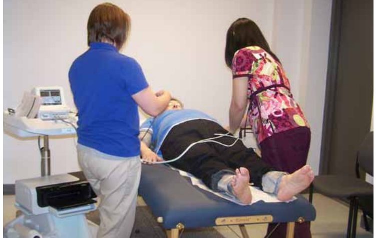
SCR Diagnostic Imaging provides a ABI screening to test for peripheral arterial disease

Thanks to all who volunteered and to the community for supporting the successful event.