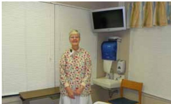
New televisions help lengthy oncology treatments pass by.