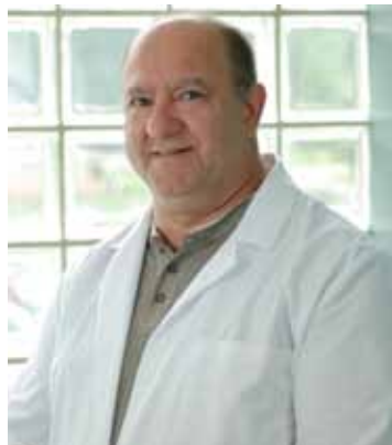
Gene Dehart Mental Health Unit