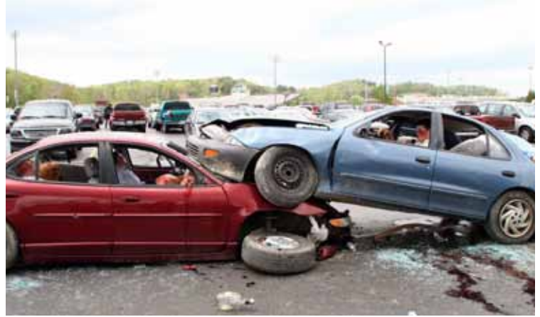
The Mock Crash staged two wrecked cars in student parking and several RCSHS students portrayed victims at the crash site.