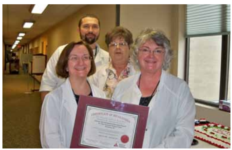
SCR Diabetes team with their ADA Recognition certificate.

The SCR Diabetes Education program provides services at the hospital and at SCR Family Medicine locations. For more information on the SCR Diabetes Education program, please contact (606) 783-6702.