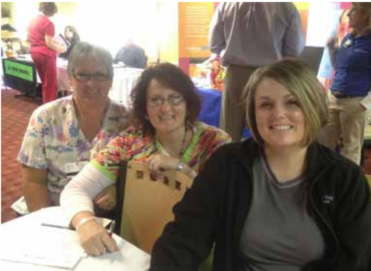
SCR staff enjoy the Benefits Fair