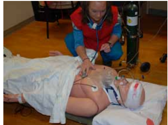
SCR Staff triage patient mannequins as part of the Code Yellow disaster drill