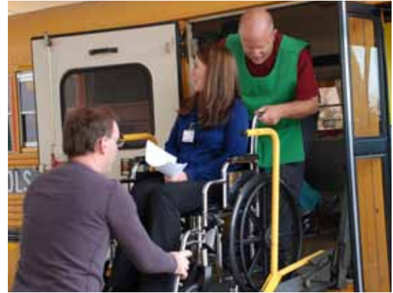
SCR Staff conduct evacuation exercises that utilize Rowan County Board of Education school buses to transport 'patients'

SCR conducts disaster drills regularly to insure steps are outlined and working efficiently in the case of an emergency situation. Following each drill a debriefing session identifies areas of success and those where actions can be streamlined. More information about SCR's disaster plan can be found on SCR's intranet under Administration > Disaster Plan.