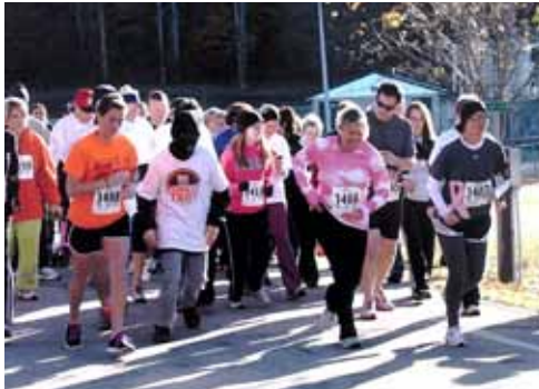
Runners leave the starting line at the Turkey Trot for a Cure 5K