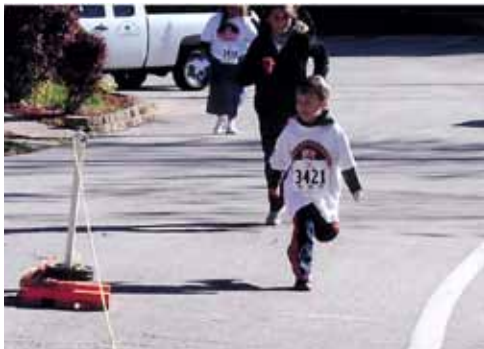
One of the youngest competitors sprints to the finish line