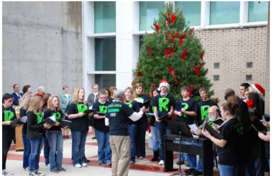
The Rowan County Senior High School "Select Choir" performed several holiday songs at the SCR Tree Lighting