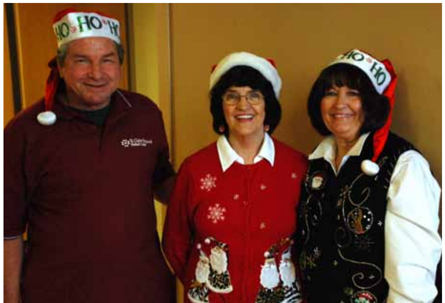
SCR Volunteers served hot chocolate and Christmas cookies to attendees