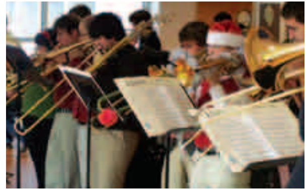
Morehead State University Trombone Band performing on Tuesday, Decemeber 13.