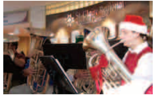
Morehead State University Tuba Band performing on Wednesday, Decemeber 14.

"Glory to God in the highest, and on earth peace, goodwill toward men." - Luke 2:14