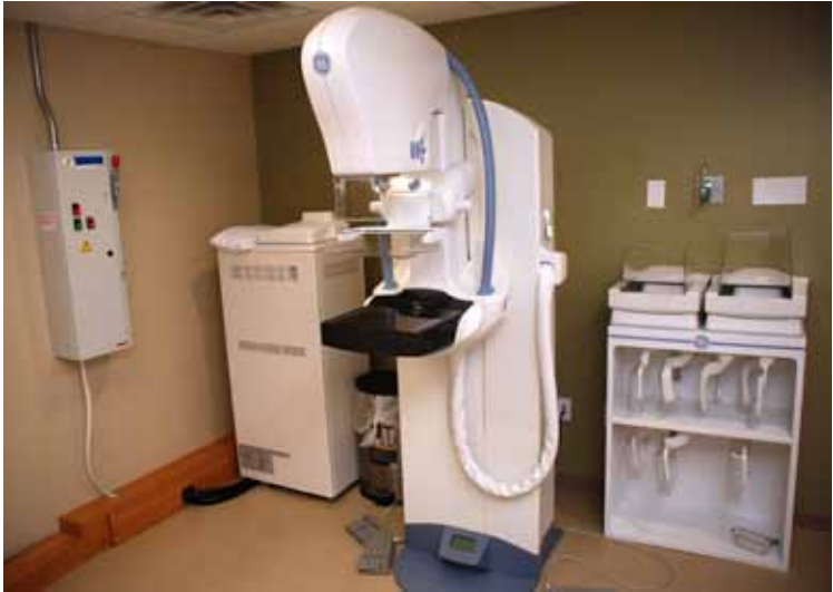
The new SCR Women's Imaging Center offers state-of-the-art diagnostics, including digital mammography.