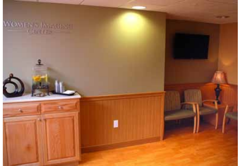
The new patient waiting room provides a tranquil, stress-free environment.