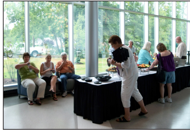
SCR and MSU staff enjoy refreshments in the CHER lobby.