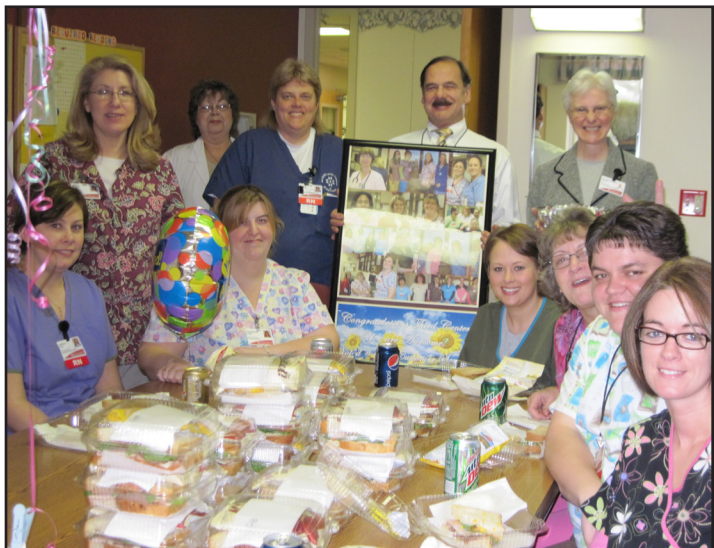
3C Staff enjoying a celebratory lunch for Root-a-bakers.