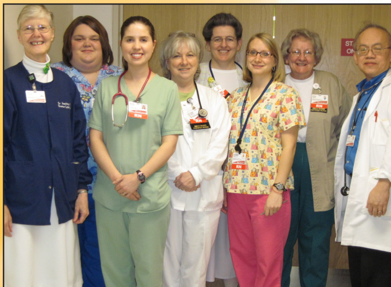
SCR Oncology Staff