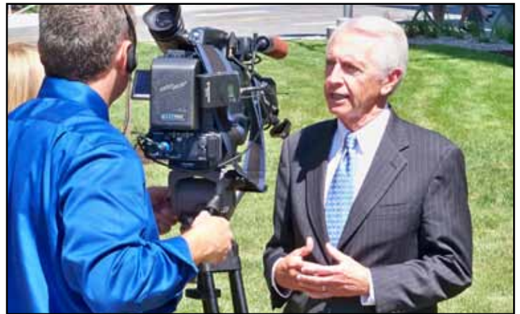
Governor Steve Beshear speaks to the MSU news crew following the dedication ceremony.

The new, $30 million Center for Health, Education and Research located on the campus of St. Claire Regional Medical Center was dedicated Friday, August 27 in a joyful celebration that attracted more than 400 persons, including two governors.