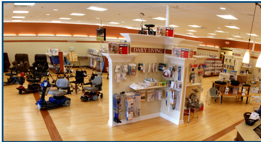
The 4,000 sq./ft. showroom stocks hundreds of items and can have many more shipped next day

space was designed to host a variety of health and education clinics – some of which include flu shot clinics, legs and feet health events, sleep apnea and back pain educational events. In addition, the retail store has private consultation rooms for clients needing braces or supports, compression garments and wound or ostomy services.