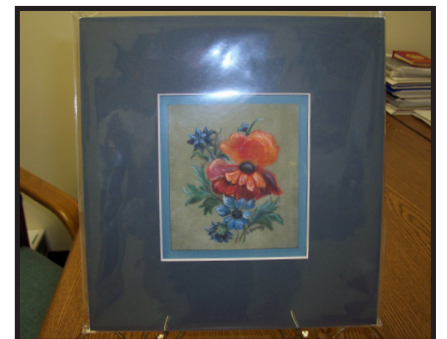
Pencil Drawing by Suanne Bushong