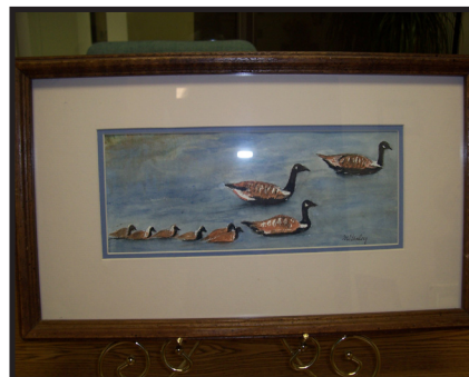
Watercolor painting by Mildred Stanley