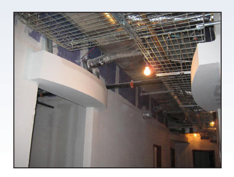
Drywall and electrical work is under way on the enterior.