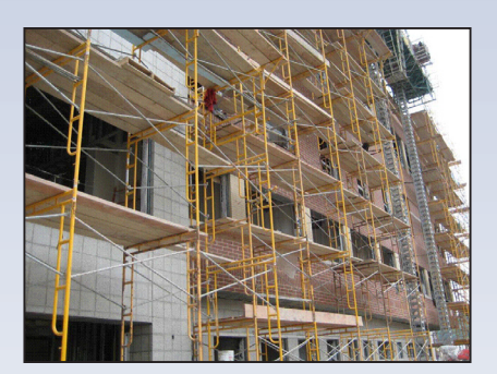
Masonry work on the exterior of the building nears completion