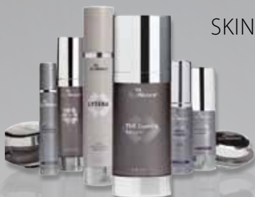
Lytera® SKIN BRIGHTENING COMPLEX