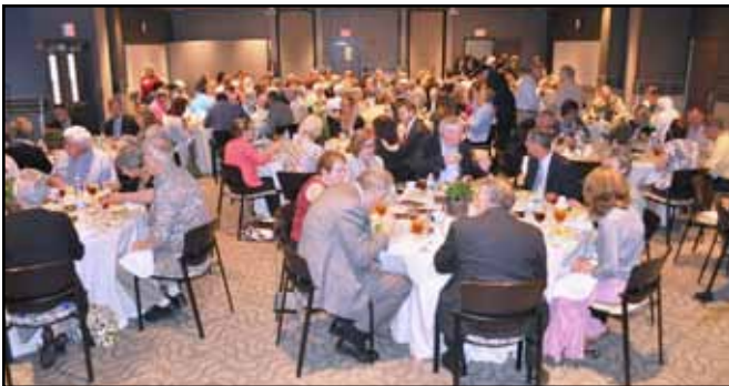
Attendees packed the CHER Building Multipurpose Room