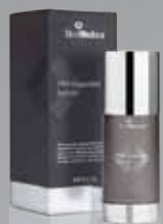
TNS ESSENTIAL SERUM®

SkinMedica® is the #1 medically dispensed, prescription-strength skin care system that can actually transform your skin. It's clinically shown to improve the appearance of fine lines and wrinkles, skin tone, texture and resiliency. Call for your FREE skincare consultation today!