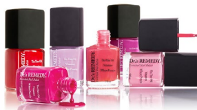
Choose from more than 20 colors!

Keep your nails healthy and beautiful with all the organic ingredients in Dr.'s Remedy!