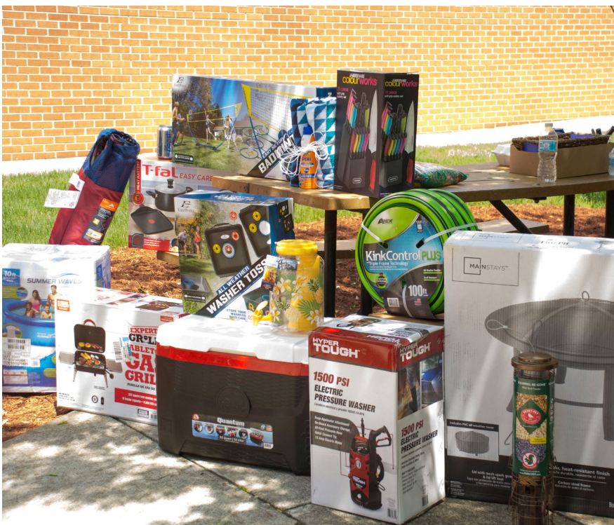
For a list of Hospital Week prize winners, see page 10.

St. Claire HealthCare celebrated 2018 Hospital Week with a staff BBQ featuring great food, fellowship with co-workers and friends and lots of sunshine! Plus, all staff were entered for a chance to win great door prizes like an outdoor swing, a fire pit, SCH logo items and so much more! Activities also included an SCH trivia game. Each staff member that accurately completed the quiz was registered to win a $25 Walmart gift card.