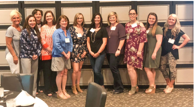
Pictured left: SCH's surgery staff who were in attendance for the AORN Bluegrass - Central Kentucky chapter meeting.