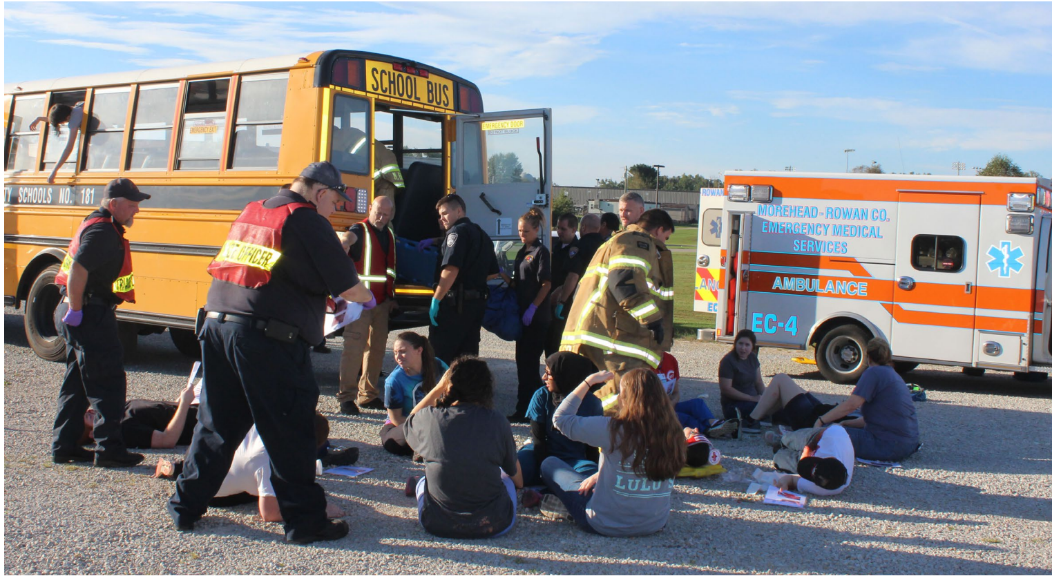
Morehead Fire Department, Morehead Police Department, Rowan County Schools Transportation Department, and Rowan County EMS worked together to rescue and evaluate those in need of medical assistance.