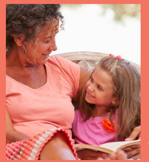
Feb. 21 • 6-8 PM

Center for Health, Education & Research FREE - No Registration Required