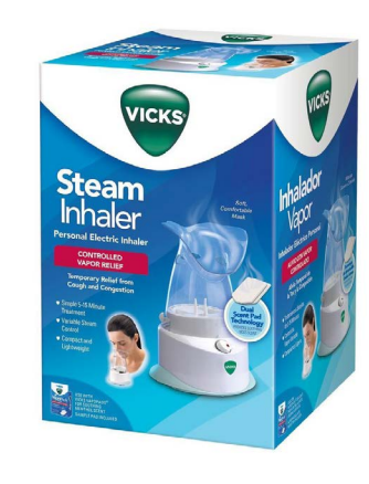
Vicks Steam Inhaler Reg. Price - $69.99

Soothe sore, aching muscles with the therma moist heating pad.