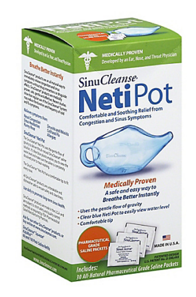
Neti Pot Reg. Price - $15.30

Rinse away irritants and gently remove excess mucous.