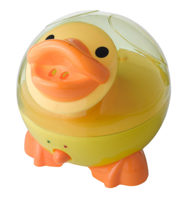
Davy the Duck Humidifier Reg. Price - $39.99

Get quick, clinically accurate temperature results. Choose from a variety of styles.