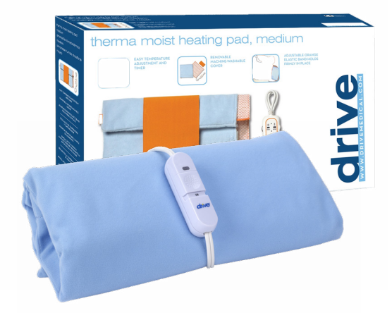
Therma Moist Heating Pad

Rinse away irritants and gently remove excess mucous.