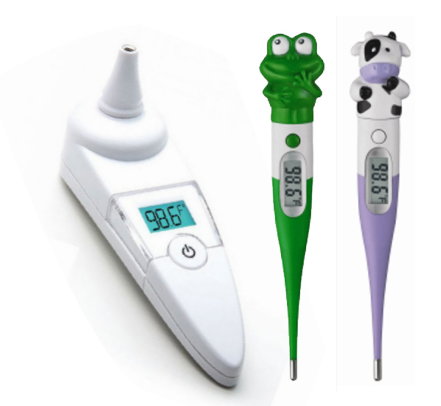
Digital Ear Reg. Price - $46.99

Get temporary relief from cough and congestion with a steam inhaler.