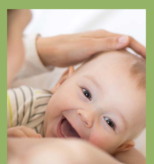
March 14 • 6-8 PM

Center for Health, Education & Research FREE - No Registration Required