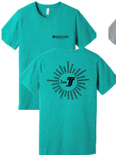
Heather Sea Green