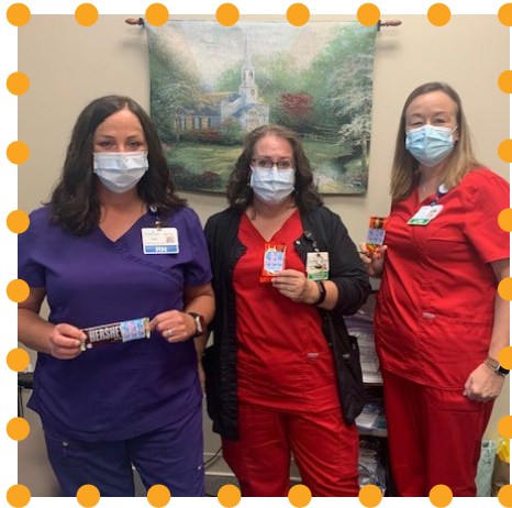
Cardiac Rehab Team First time the department is paperless.