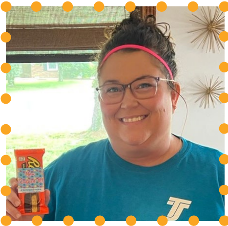
Sara Beth Stotts Patient Access was the first department to fill out the ATE google doc form.