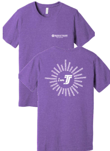
Heather Team Purple