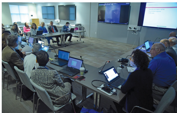
Interdisciplinary Tumor Board Meeting

In addition, the Hospital offers comprehensive services to support every aspect of physical and emotional well-being.