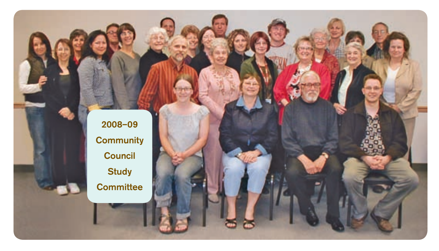
The 2008–09 Study Committee met for 24 weeks at the St. Francis of Assisi Church parish hall to assess the educational, mental health and housing needs of our region's children. During the course of study about 70 people participated, some of whom are shown here.