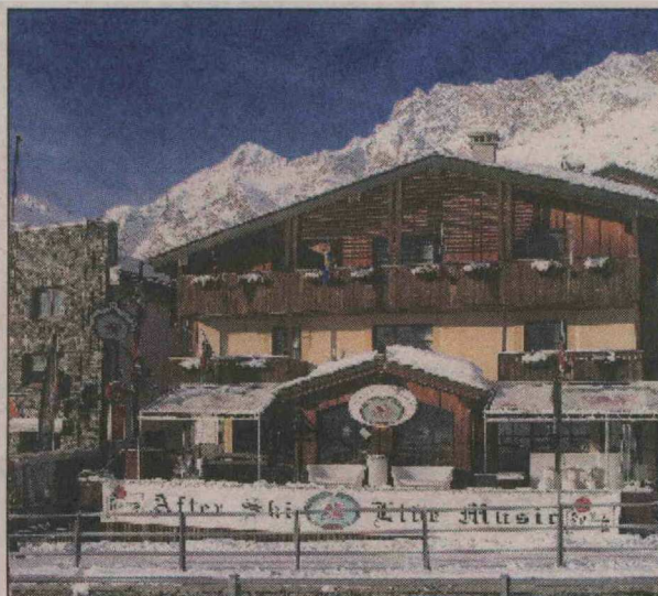
COSY APRES SKI HOTSPOT . . . The Hotel Chalet Dragon in Cervinia is the perfect mountain getaway for those seeking a fun-packed ski holiday. 1603IC04