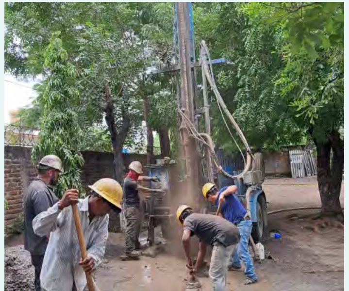
Reaching an underground aquifer at 60 meters, the Living Water staff ensures water safety through testing and treatment, then finishes by installing a hand pump.