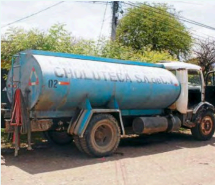
With no other water sources nearby, families reluctantly pay the high cost to purchase water from a water truck.

Desperate for a sustainable solution, community leaders came together to see what they could do about the situation. When they heard about the work Living Water International was doing in the area, they reached out for support. Living Water Honduras responded by drilling a new borehole and installing a hand pump directly on the school's grounds! At last, thanks to your incredible generosity, school staff and students at the Colonia Gracias a Cristo School are able to enjoy reliable access to safe water all day long!