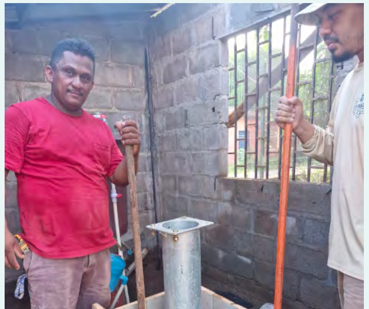
Living Water staff work to rehabilitate the existing borehole. After reaching an underground aquifer at 40 meters, they test and treat the water to ensure it is safe before installing the integrated pump, the dosing device, and a tap that residents can use to easily access water.