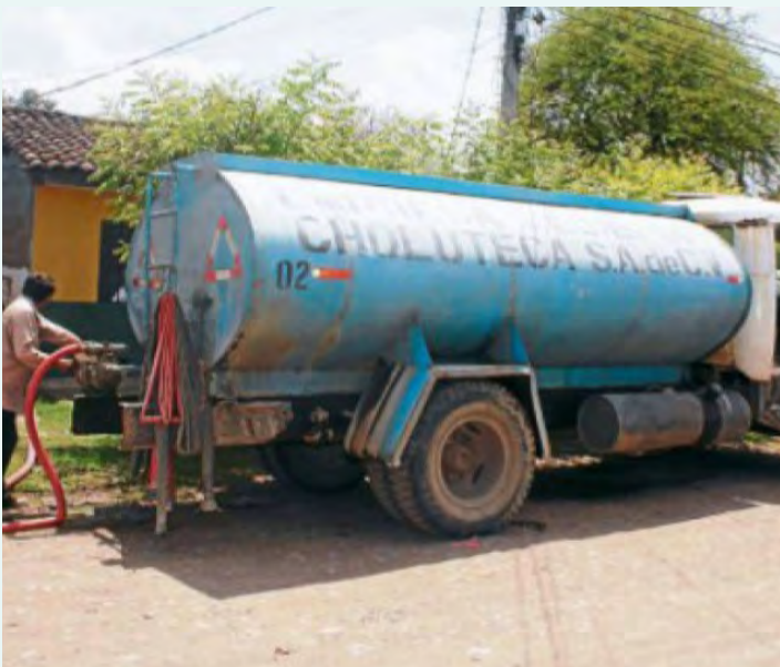
With no other water sources nearby, residents reluctantly pay the high cost to purchase water from a water truck.

Community leaders knew that things could not go on as they were. Coming together, they sought a sustainable solution. When they heard about the work that Living Water International was doing in the area, they reached out for help. Living Water Honduras responded by rehabilitating the existing borehole and installing a dosing device that injects the proper amount of chlorine to ensure safe, high-quality water. After going so long without access to safe water, the residents of the Barrio El Estruendo community are deeply grateful for this life-changing gift.