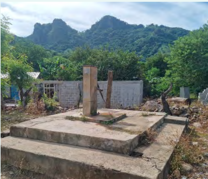
The community's well has not been cleaned and treated with chlorine in over 20 years, making the water quality very poor.

Desperate for a sustainable solution, community leaders came together to see what they could do about the situation. When they heard about the work that Living Water International was doing in the area, they reached out for support. Living Water Honduras responded by rehabilitating the borehole and installing a new hand pump just outside residents' doors. At last, thanks to your incredible generosity, the residents of the Los Planteles community are able to enjoy reliable access to safe water!