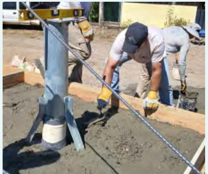
Reaching an underground aquifer at 32 meters, the team proceeds with safety checks and treatment before finalizing the project with a hand pump installation.