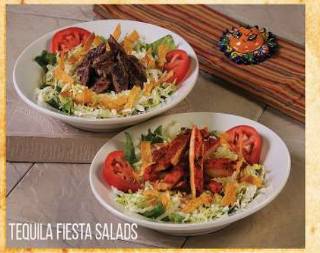
TEQUILA FIESTA SALADS

Our hamburgers can be cooked to order. However, please be advised that consuming raw or undercooked meats, may increase your risk of foodborne illness.