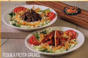
TEQUILA FIESTA SALADS

Our hamburgers can be cooked to order. However, please be advised that consuming raw or undercooked meats, may increase your risk of foodborne illness.