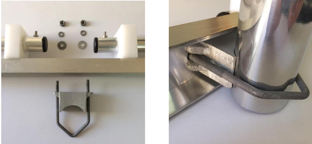
Figures 4 / 5

2.5.2 - Perform the installation of the highest antenna possible and free of obstacles, other antennas, walls, etc. For optimum performance and good SWR install 10m height of the base of the antenna or at least 5.50m.