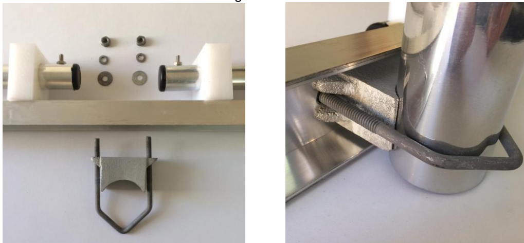
Figures 4 / 5

2.5.2 - Perform the installation of the highest antenna possible and free of obstacles, other antennas, walls, etc. For optimum performance and good SWR install 10m height of the base of the antenna or at least 5.50m.