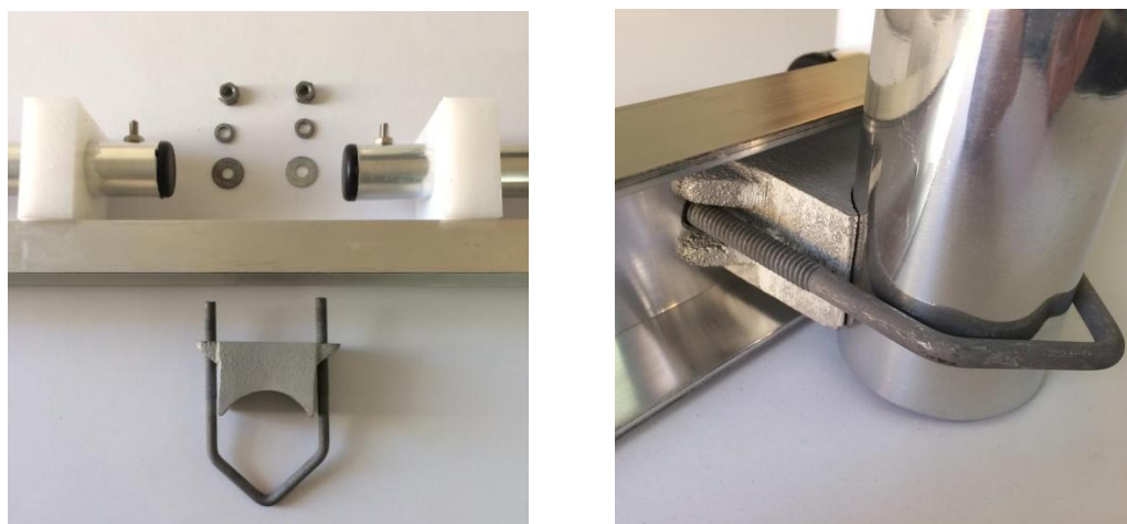
Figures 4 / 5

2.5.2 - Perform the installation of the highest antenna possible and free of obstacles, other antennas, walls, etc. For optimum performance and good SWR install 10m height of the base of the antenna or at least 5.50m.