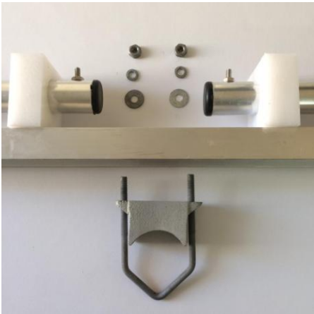
Figures 4 / 5