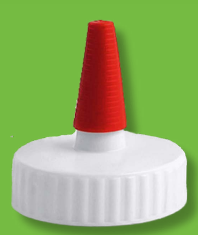
Long and short sealer tips available