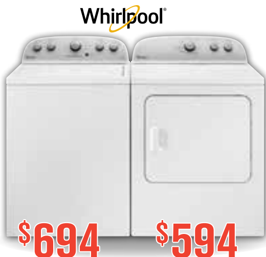
4.4-4.5 cu. ft. Top Load Washer with Removable Agitator WTW4957PW