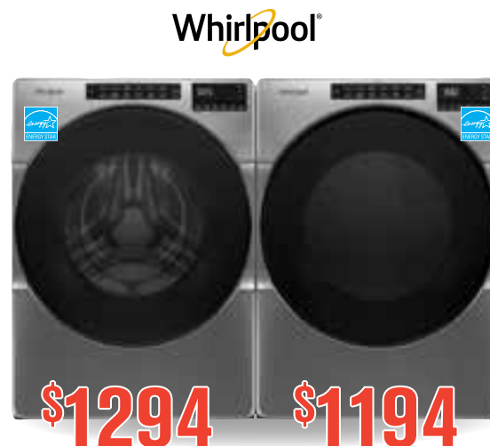
5.8 cu. ft. Front Load Washer with Quick Wash Cycle WFW6605MC