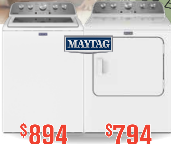
Top Load Washer with Extra Power - 5.5 cu. ft. MVW5430MW