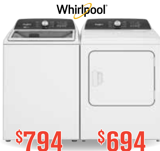
5.4-5.5 cu. ft. Top Load Washer with 2 in 1 Removable Agitator WTW5057LW