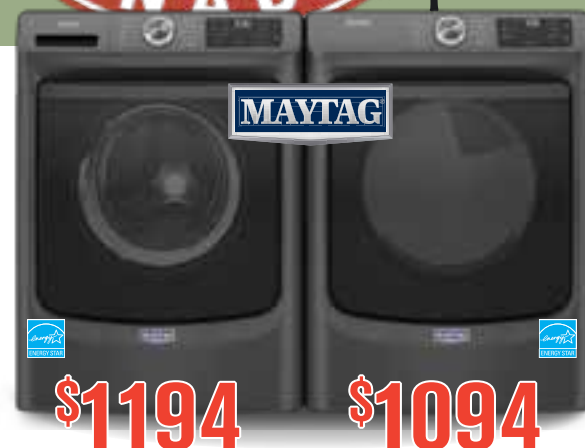
Front Load Washer with Extra Power and 12-Hr Fresh Spin™ option - 5.2 cu. ft. MHW5630MBK