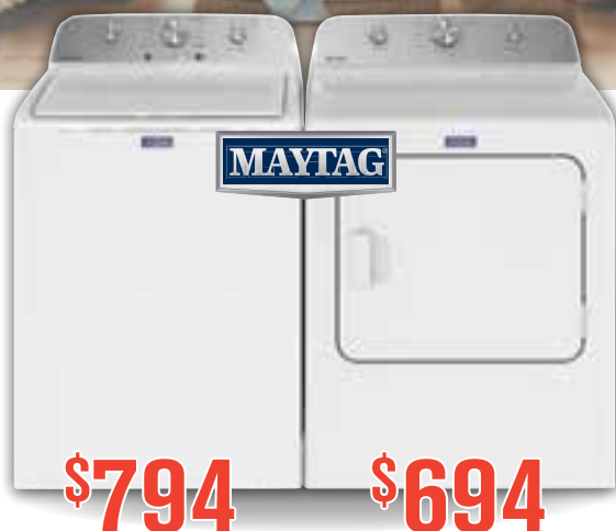
Top Load Washer with Deep Fill - 5.2 cu. ft. IEC MVW4505MW