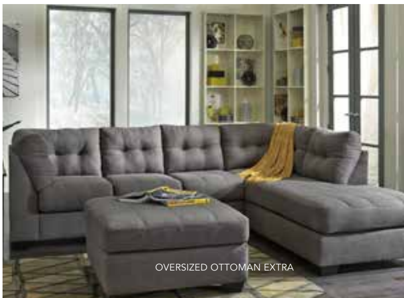
OVERSIZED OTTOMAN EXTRA