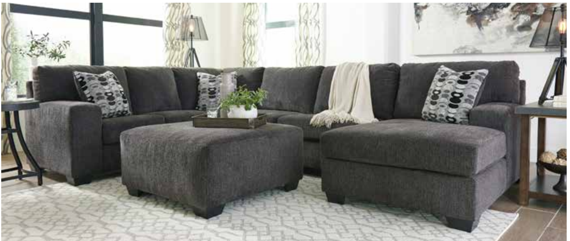
the Ballinasloe 3 PIECE SECTIONAL

NO INTEREST & NO PAYMENTS FOR 12 MONTHS* on a wide selection of furniture & mattresses oac* (If paid in full)