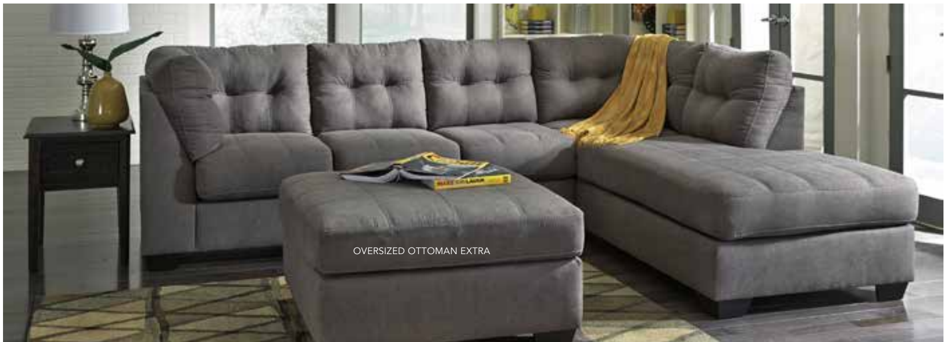
OVERSIZED OTTOMAN EXTRA

Sleek, sultry and tailored to a T with plush yet structured cushioning packed with metro modern flair this Maier sectional is where sophisticated style meets everyday comfort.