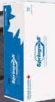
BED IN A BOX